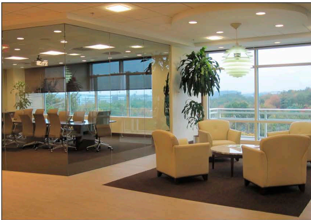
InterGen's new location houses nearly 100 employees.