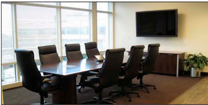
One of the many conference areas